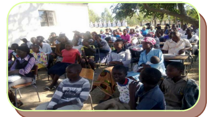
The new church at Dombo has a membership of more than 50

We give thanks to God for the work He is doing and we believe more is still to come. We also thank our supporters for making this year's campaign a success. Keep praying that the Lord opens more doors for the work to done.