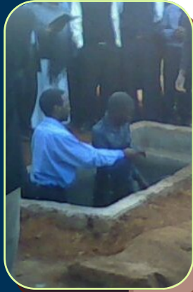
Baptism at Lutumba, new life in a newly build baptism pool, a pool built by Society.

"An amazing work was accomplished through humble instruments."