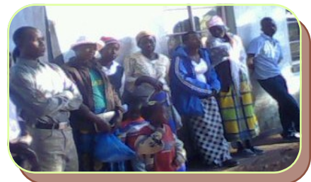
Taking their vows! Baptismal candidates take vows before being baptized—Lutumba Beitbridge