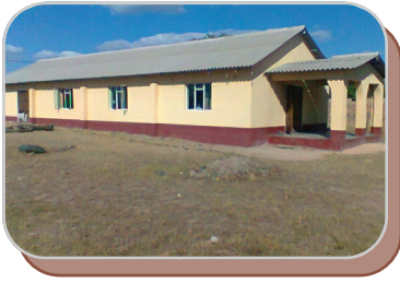
The church at Nyamuzuwe, Mutoko