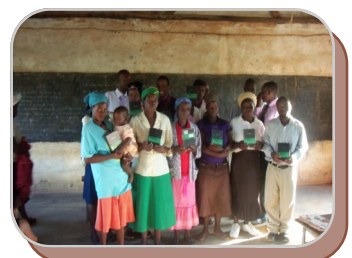
Some of the members who received Bibles at revisit

promise was made on this one, but per chance if opportunity comes up Society may consider another zunde. Because the bibles were few and there were many people needing them, not everyone benefited, but we can still help with more Bibles.